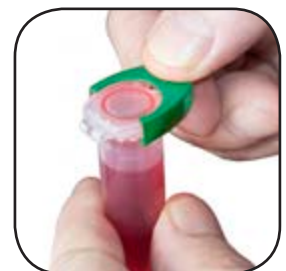
Cap Lock Green #DLAU660-75CLG