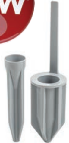
Made of Acetal plastic Reusable and freezable (-90 °C) #DLAU660AD15 & #DLAU660AD50