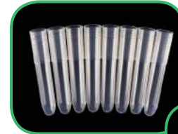
8 Strip Tubes