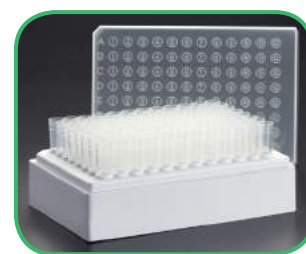
96 Place Rack