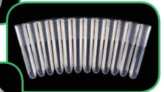
12 Strip Tubes